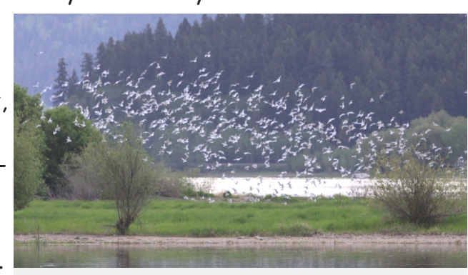
Ring-billed Gulls wheeling above Christmas Island

counted on Christmas Island, with an average of 3 eggs per nest. If they all survived that would be another 1800 gulls in the Bay – and this bird is red listed !!! Last, but not least, are the Western Grebes. There was a high count of 260 birds on May 5 scattered across the Bay. By mid May courtship was in full display and nesting sites were being sought out. There was at least one pair of Clark's Grebes with them, and one Clark's Grebe pairing with a Western Grebe.