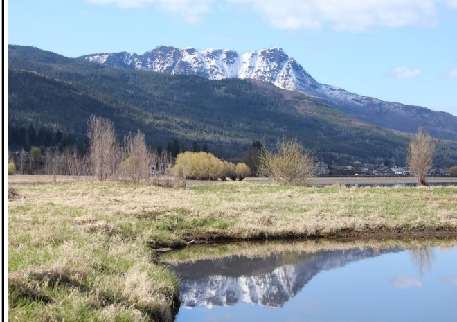
Beaver Pond and Mount Ida taken from the Foreshore

I welcome your comments, ideas, articles, poems and photographs for your future newsletters. Please e-mail them to me at sabnes.org@gmail.com, or mail them to the SABNES postal address on the back sheet.