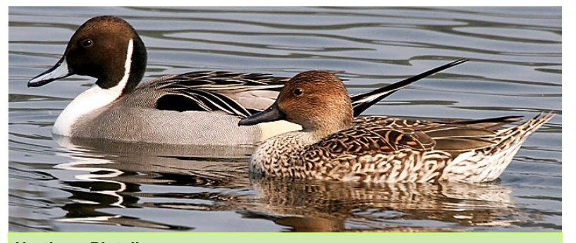
Northern Pintails . These dabbling ducks are widely spread over all the earth. A Pintail skeleton was found at 16,400 ft on the Khumbu Glacier during the first ascent of Mount Everest in 1952

attached to the washrooms, six or seven pairs of cliff swallows nested, their numbers in the wharf area being much lower than usual. Continuing to decline are the numbers of insect-eating birds, namely swallows , nighthawks, swifts and flycatchers . The continual destruction of habitat and the increased use of insecticides will a cause a further decline. Perhaps because of late high lake waters fewer coots and shorebirds made an appearance.