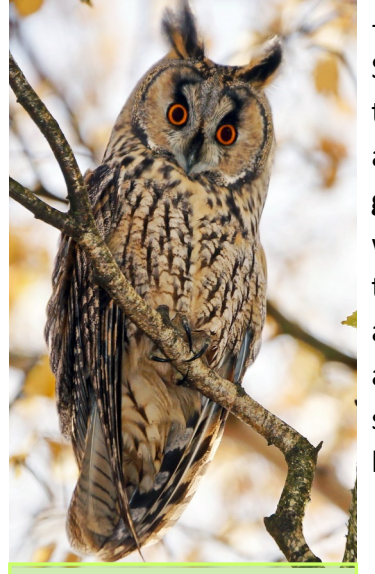
Long-eared Owl. This nocturnal bird has the ability to fly silently and enjoys a diet of small critters such as mice and voles.

gray-crowned rosy-finches appeared in Peter Jannick Nature Park. These mountain finches may have come to the valley bottom because of inclement weather higher up.