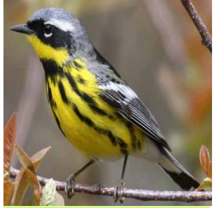
Magnolia Warbler. Males court females with song and show off the white spots on their tails.

gray-crowned rosy-finches appeared in Peter Jannick Nature Park. These mountain finches may have come to the valley bottom because of inclement weather higher up.