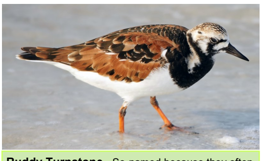
Ruddy Turnstone. So-named because they often flip over stones to get at prey living underneath .

Birders around Salmon Arm Bay have found it to be an average year. A total of 198 species have been recorded since January 1, including 38 species of waterfowl, 26 species of shore birds and seven species of gulls, all with a slightly higher count than last year.