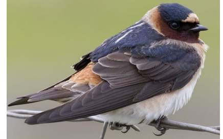
Cliff Swallow. Typically will build its nest from mud collected using its beak.

billed gulls. Once again, over 500 nesting pairs raised over a 1000 young. Among them were a pair or two of nesting short-billed (mew) and herring gulls. Two pairs of bald eagles , nesting on the south side of the Bay, successfully raised five young. Not so successful were the osprey. No nests occupied the wharf area. A pair spent all summer building a nest on Lakeshore Road near the Credit Union but don't appear to have laid eggs – perhaps next year, if the Canada geese don't get there first. The swallows also did not fare well. Vandals destroyed most of the nesting boxes along the Foreshore Nature Trail in April and May, including both eggs and birds. Even after