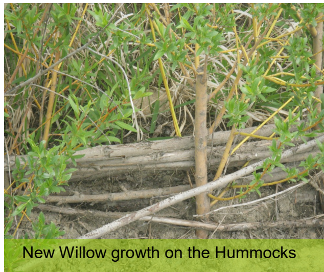
New Willow growth on the Hummocks